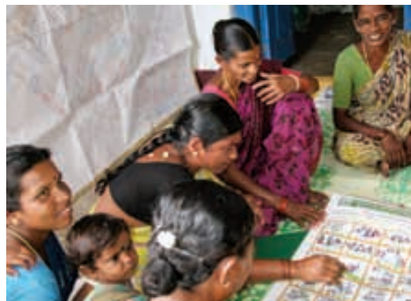
Self-monitoring by self-help groups

these assemblies are meeting regularly, becoming more inclusive of women and marginalised groups, and are making decisions and using funds for the purpose intended. There has been good progress in fund disbursements and in strengthening transparency and accountability at village level. The process of establishing micro-plans, requesting and utilising funds has been well coordinated by these assemblies.